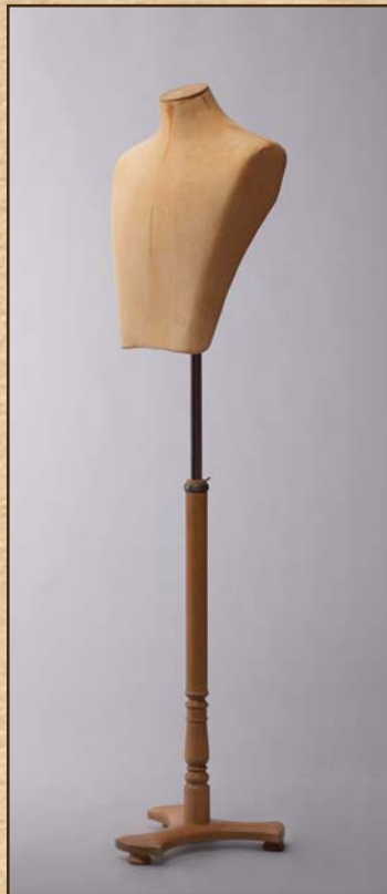
Open back shirt bust VSM06