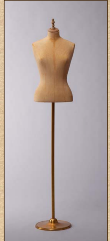
Knitwear body VSF04