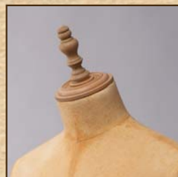
Antique neck/finial VSN11