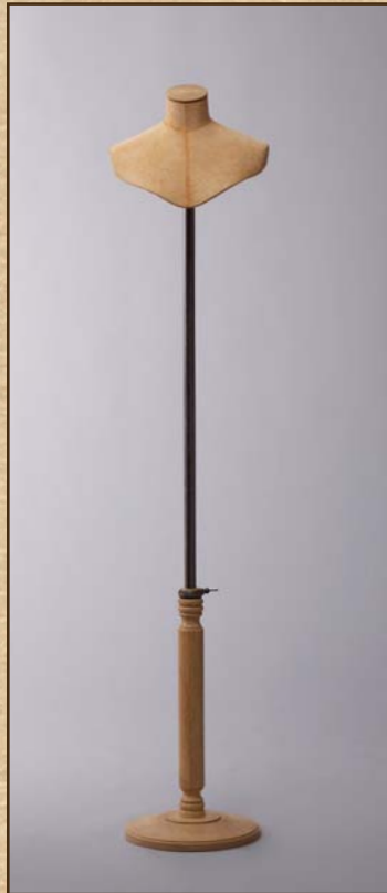
Female fichu VSF06