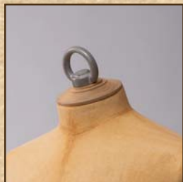
Metal ring neck VSN05