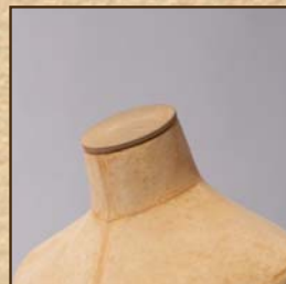
Flat wooden neck VSN07