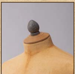
Pinecone neck VSN08