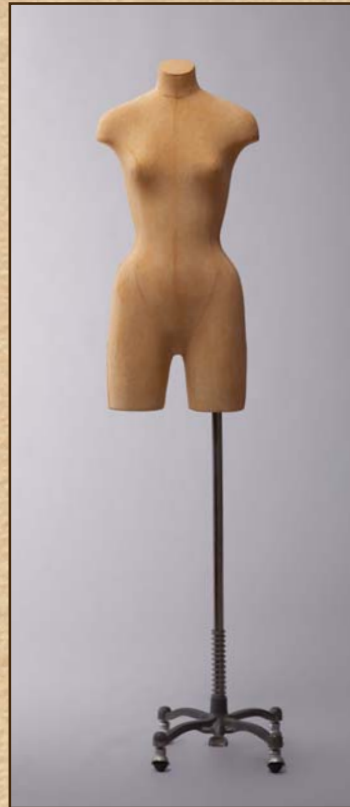
Corset form VSF07