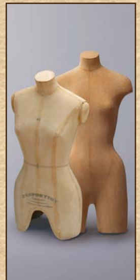
STAINING OPTIONS Front figure - tea stained Back figure - coffee stained