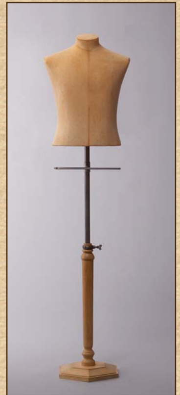
Blouson form (trouser bar optional) VSM04