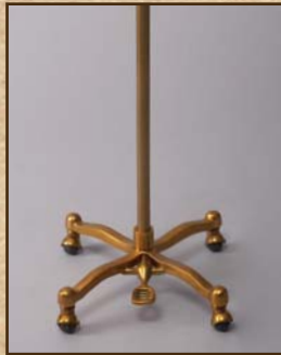
Brass dressmakers base VSB02