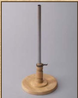
Paris countertop base VSB11