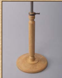
London base VSB08