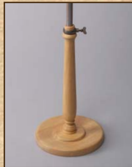
Paris medallion base VSB09