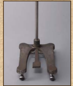
Horseshoe base VSB05