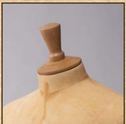
French neck/finial VSN04