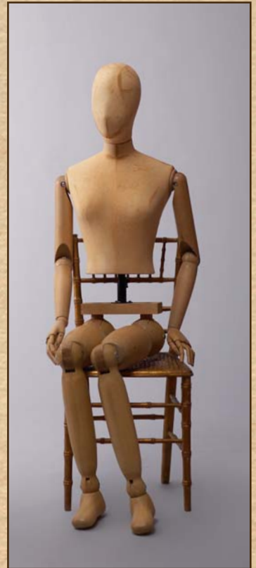
Articulated female VSF08