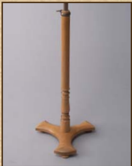
Tricorn base VSB06