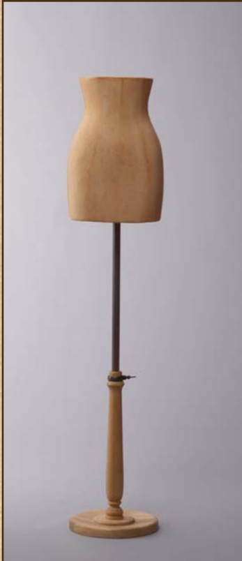
Skirt form VSF09

Focusing specifically on aged finishes, proportion>london's Vintage Style collection offers you the most authentic "new/old" bust forms available today. Vintage Style creates a display form that will beguile even the most fastidious of antiquarians!