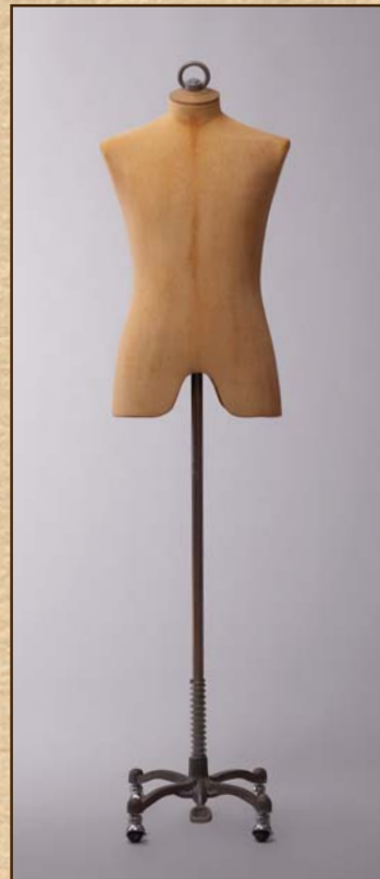
Cutaway body VSM03