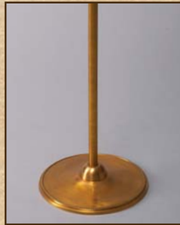
Brass vintage base VSB03