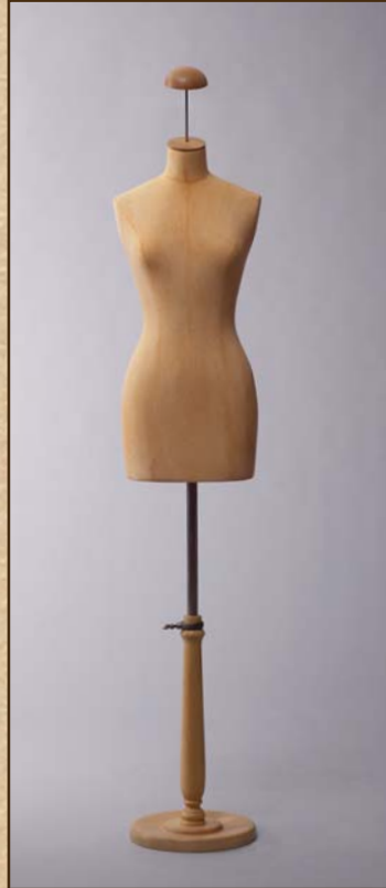
Full body VSF02