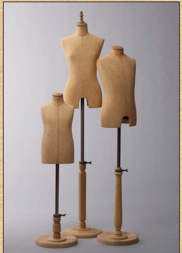
Child size bust forms are available in three different body shapes