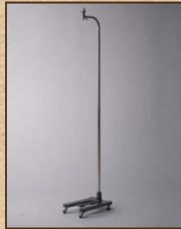
Horseshoe hanging base VSB04