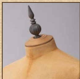
Vintage neck VSN09