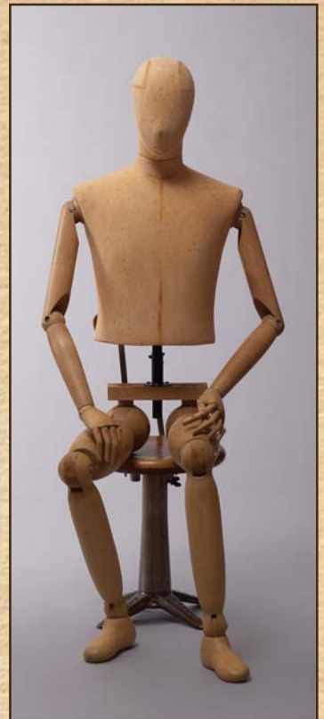
Articulated male VSM08