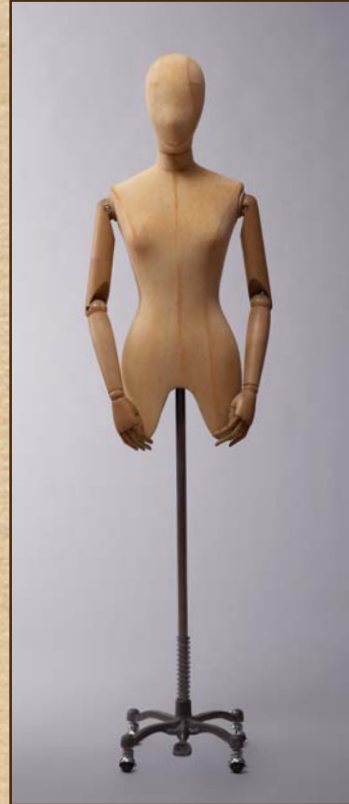
Cutaway body VSF03