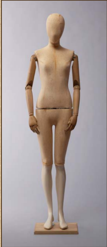
Harlequin classic female VSF01