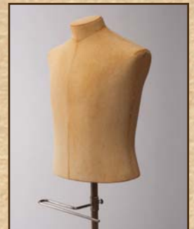
Trouser bar VSN03