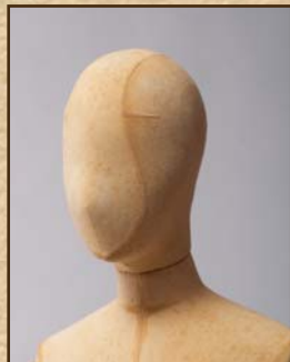
Head (male/female) VSN01