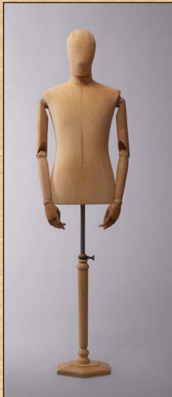
Full body VSM02