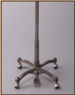
Raw dressmakers base VSB01