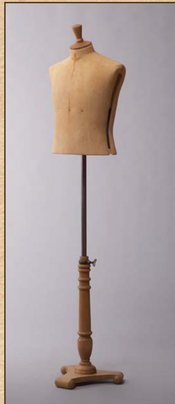
Tuck away shirt bust VSM07