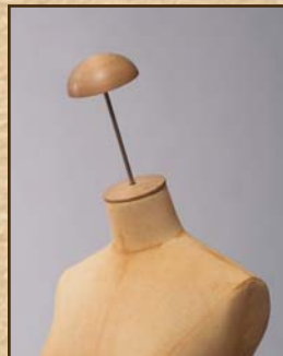
Hat-dome neck VSN02