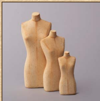
Male and female miniature forms