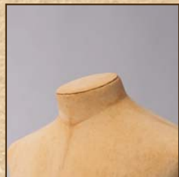
Closed in neck VSN06