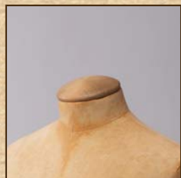
Domed wooden neck VSB10