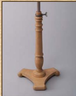
Scroll base VSB07