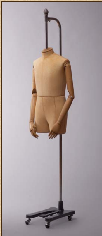
3/4 hanging form VSM05