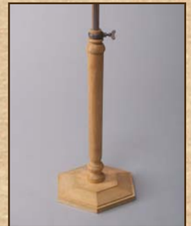
Hexagon base VSB10