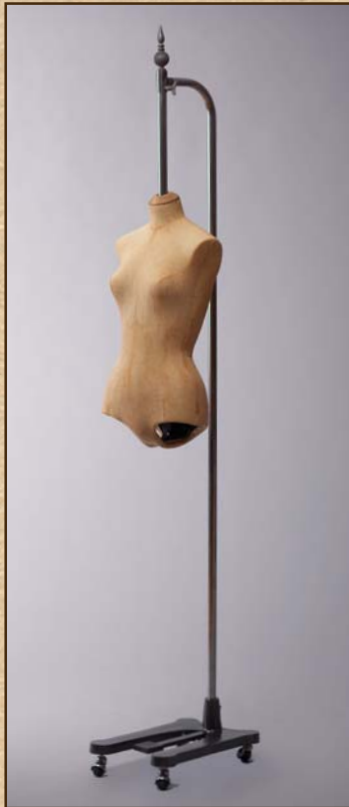
3/4 hanging lingerie form VSF05