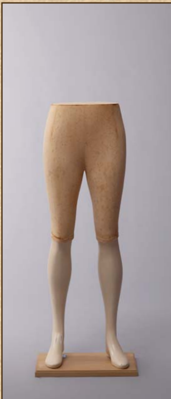
Trouser form VSM09