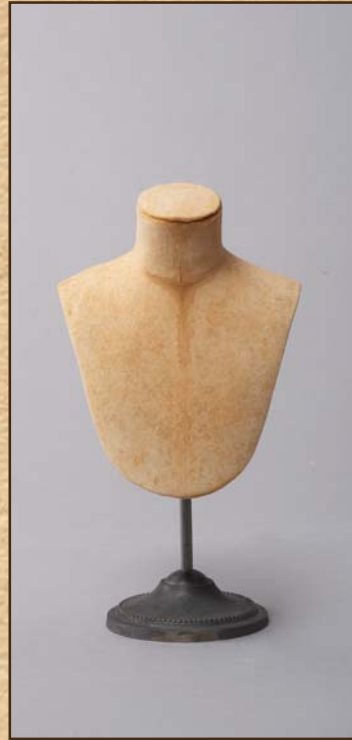
Jewellery stand VSA17