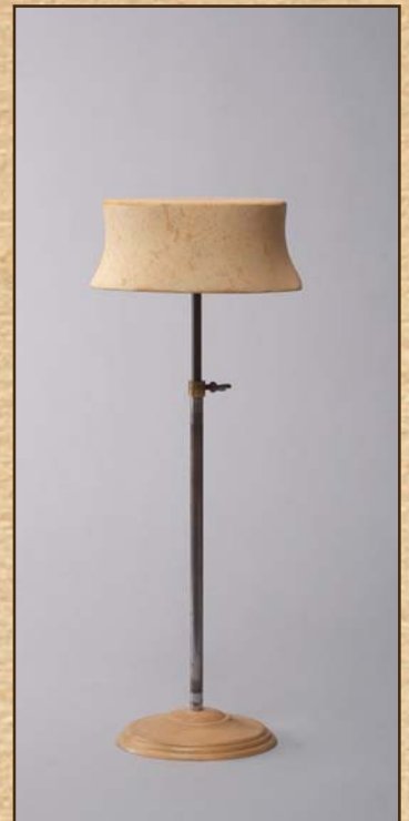
Waist stand (female only) VSA20