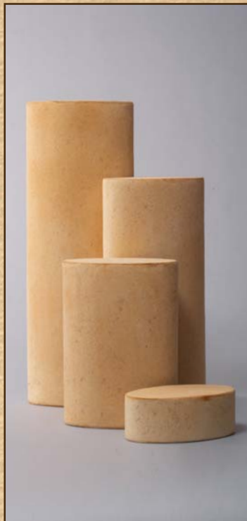
Belt drums (male/female)