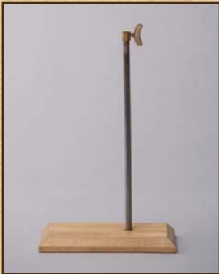
Bag stand base 300mm VSA29