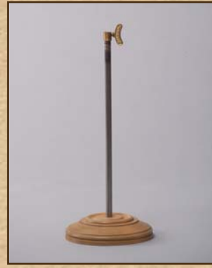
Turned wood base VSA23