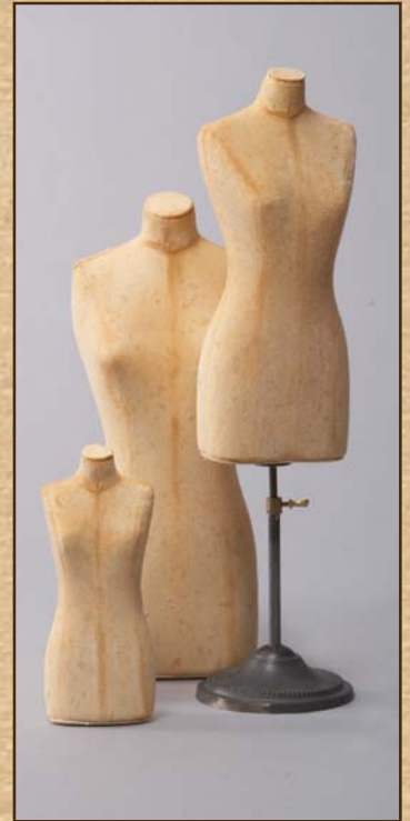
Female miniature forms (half, third & quarter scale)