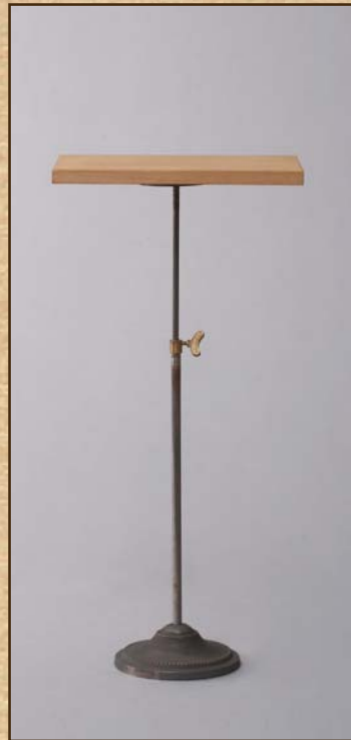
Riser stand VSA13