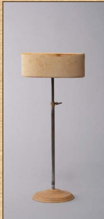
Belt drum stand (male/female) VSA19