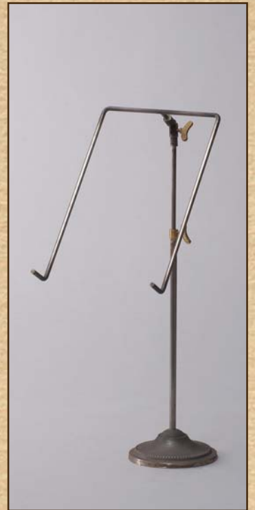
Shirt or bag easel VSA14