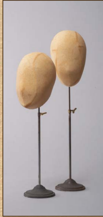
Vintage hat head (male/female) VSA07