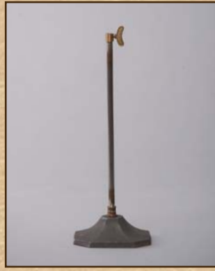
Octagonal metal base VSA22