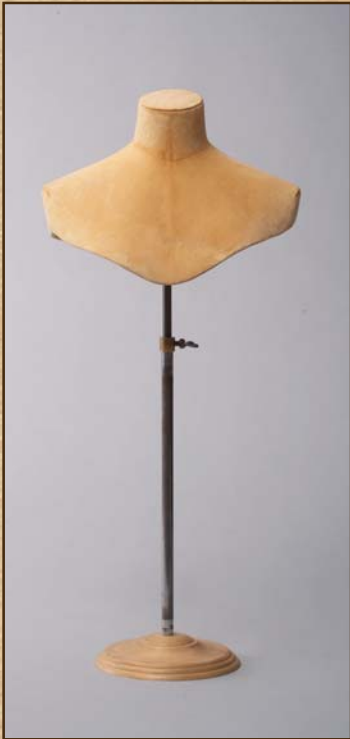
Female fichu VSA09