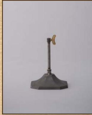
Octagonal metal base VSA26