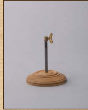
Turned wood base VSA27