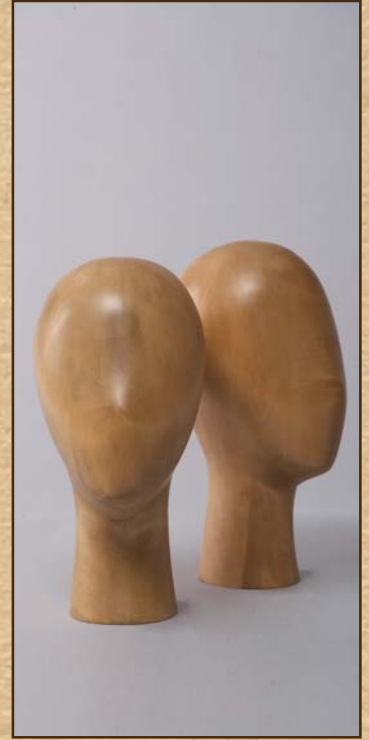
Wooden hat head (male/female) VSA08