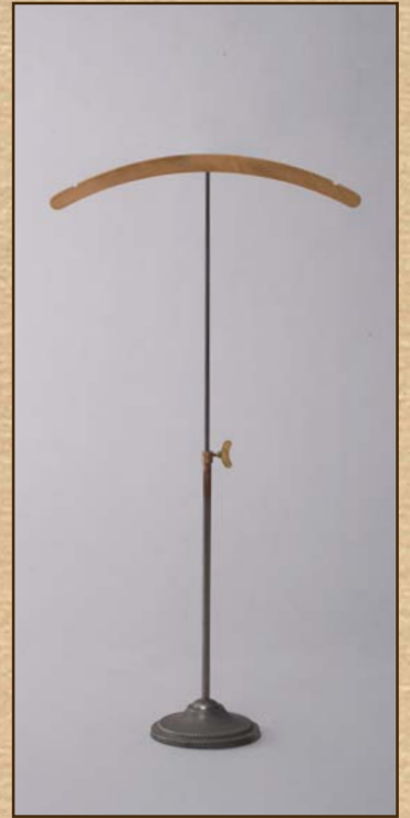
Lingerie hanger VSA04