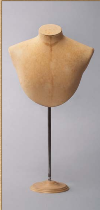
Male scarf neck VSA10