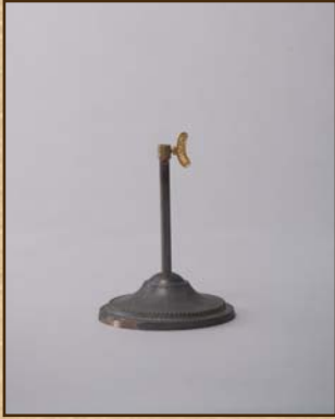
BASE STANDS 120mm Cast metal vintage VSA25