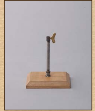
Square wood base VSA28