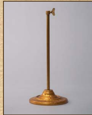
Large retro cast base 400mm (for shoulder forms) VSA31