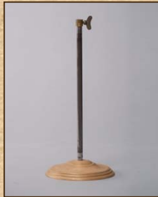
Large turned wood base 400mm (for shoulder forms) VSA30