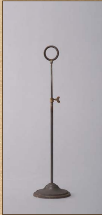
Scarf ring VSA03