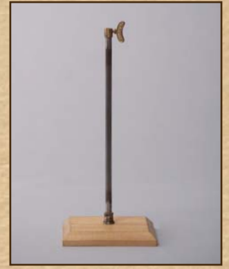
Square wood base VSA24