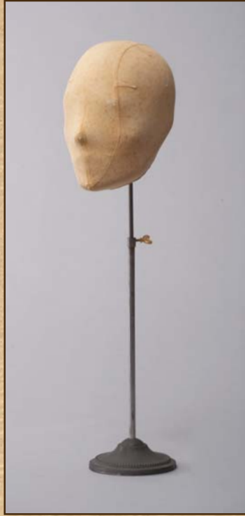
Couture hat head VSA06