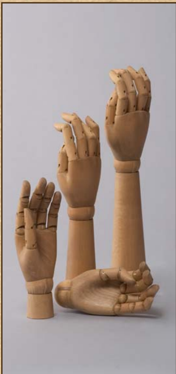
Wooden articulated hands (male/female)