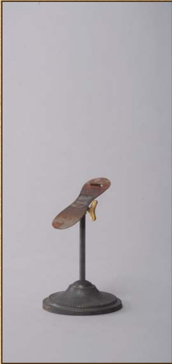
Variable angle shoe stand VSA15