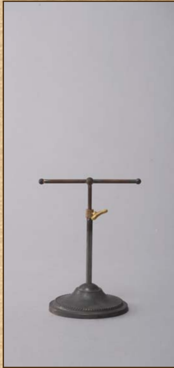
Earring stand VSA16