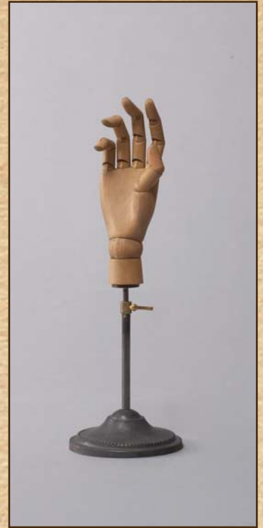
Glove hand VSA18