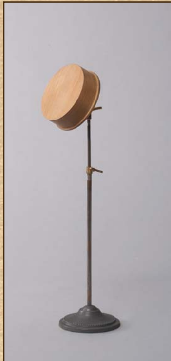
Tie presenter VSA12