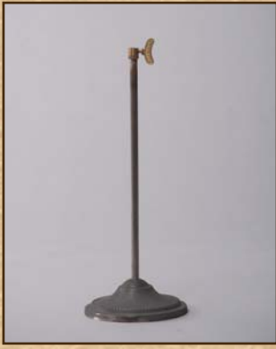
BASE STANDS 300mm Cast metal vintage VSA21