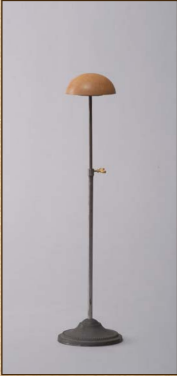
Wooden hat dome VSA05