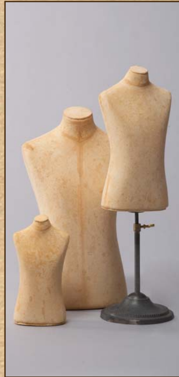
Male miniature forms (half, third & quarter scale)